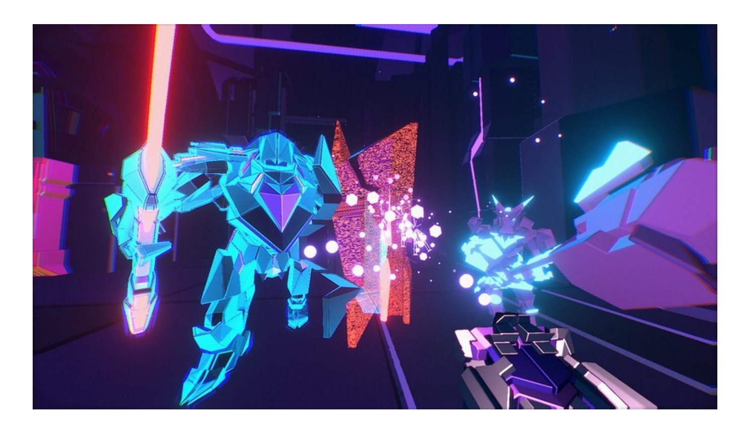
DESYNC: The Original Soundtrack - Volume 1 (Daniel Deluxe) Free Download [key Serial]

Download ->>->> <a href="http://bit.ly/2NHDIVK">http://bit.ly/2NHDIVK</a>